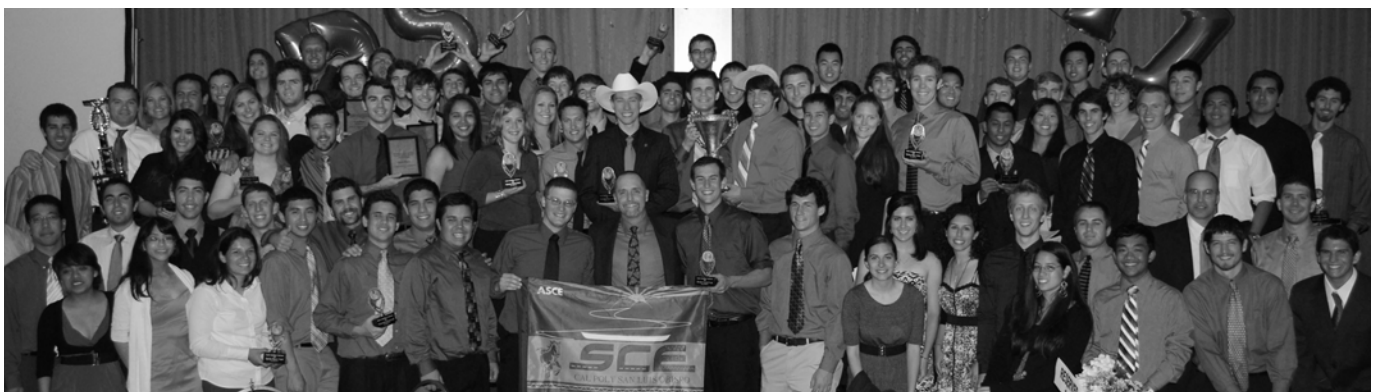
2011 Pacific Southwest Conference Champions

*Any donation to SCE of $200 or more will get your company's logo on our 2012 PSWC T-shirts and the "Sponsors" section of our website at www.cpsce.com *